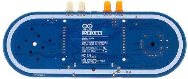
Arduino Esplora Rear